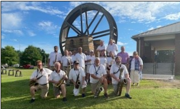
Sounds of Summer presents Sweet Georgia Sound Friday, July 5th.

Friendly City Festivals announces the third concert in the 2024 Sounds of Summer series will be big band favorite from Chattanooga Sweet Georgia Sound on Friday, July 5th.