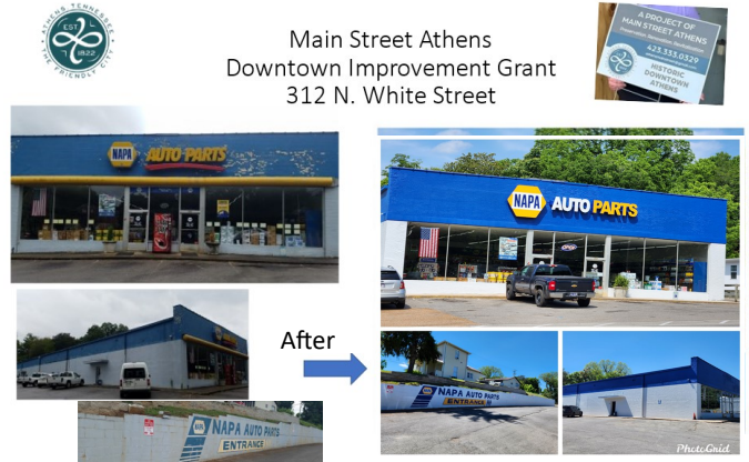
Main Street Athens Downtown Improvement Grant 312 N. White Street