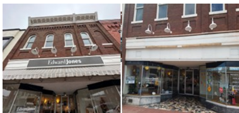
10 North White Street