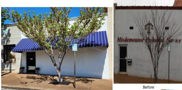
Note: Tree will be trimmed