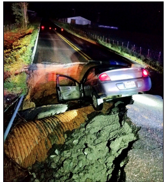
THP Officer Travis Ryans investigated. (Photo by Lynn Ingram, Englewood Rural Fire)

(Photo by Lynn Ingram, Englewood Rural Fire)