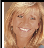
Meet 2001 SURVIVOR Tina Wesson

(Feel free to copy, post or otherwise distribute) (Phone: 746-1390 Fax: 744-1390 e-mail: wyxi@bellsouth.net )